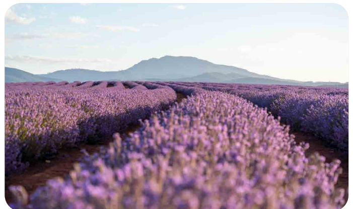
Bridestowe Lavender Estate