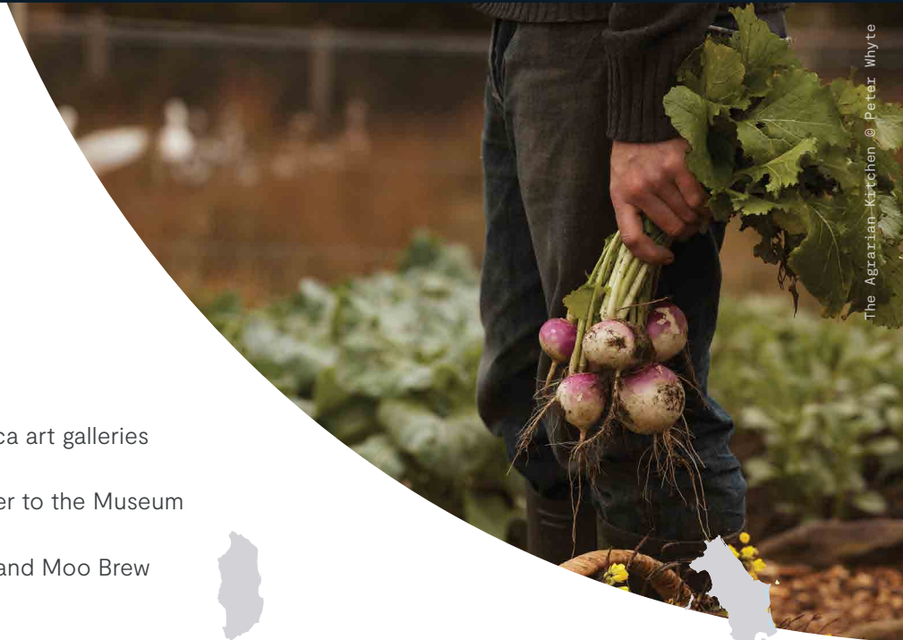
The Agrarian Kitchen