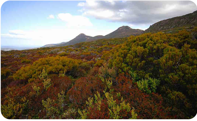
Hartz Mountains National Park