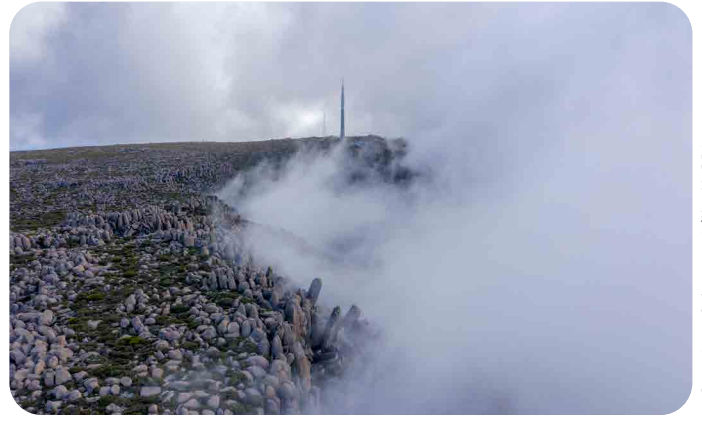
Summit of Kunanyi/Mt Wellington © Luke Tscharke